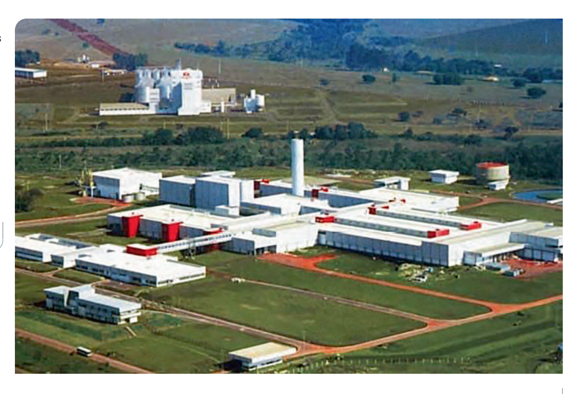
Perdigão's pigs and chicken slaughterhouse and sausage production project for over 1000 t per day in 2000.

Under Heinrich Meyer's leadership, the company relocated to the spa town Aulendorf in Southern Germany and expanded its ventures in the slaughtering and meat processing sector.