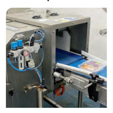
1Q4 Metal Detection Combination solution in action.

Following a competitive tender, Forrester's preference went to Loma's IQ4 Combination System for simultaneously detecting metal contaminants and reducing food