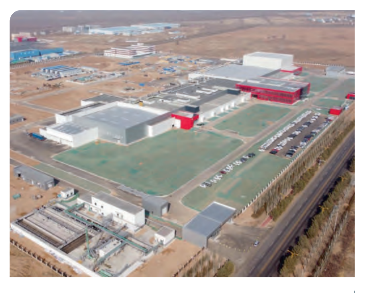
CP Food's 2022 meat processing plant building site in China.

As the industry is evolving towards more sustainable prac-